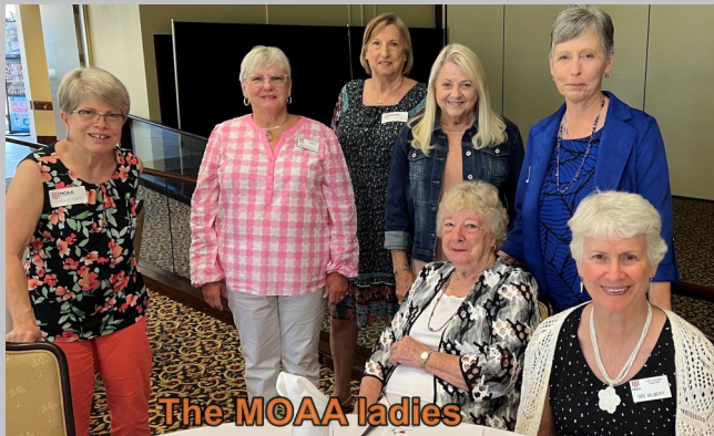
The MOAA ladies