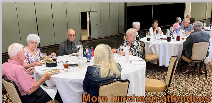
More luncheon attendees