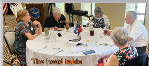
The head table