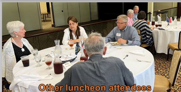
Other luncheon attendees