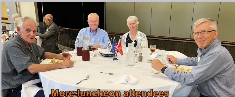
More luncheon attendees